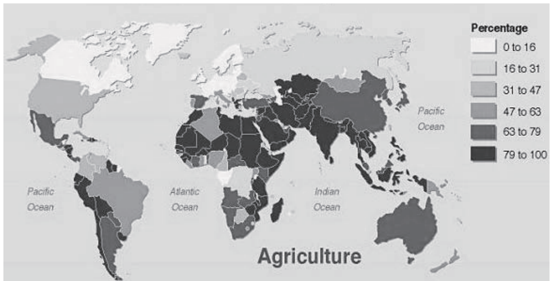
Figure 1. Freshwater withdrawals for agricultural use in 2000

fertilizing properties but mostly because it is the only way to earn a living (Jiménez and Garduño 2001; IWMI 2003).