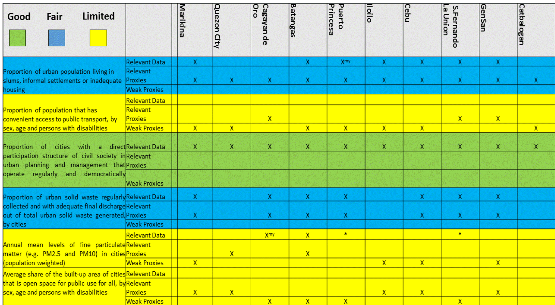
Figure 2: Summary Assessment of Ten Cities in the Philippines

The figure is color coded to provide an overall evaluation of the coverage of data for each of the indicators. The coverage is considered good for one indicator and fair for another two. Three of indicators have more limited coverage. The superscript "my" refers to multiple years.