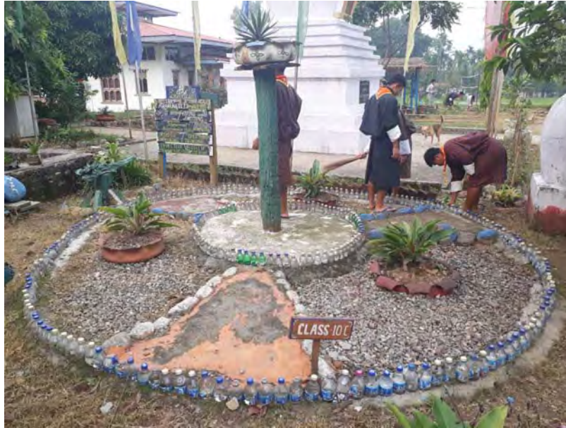
Bottles used for gardening