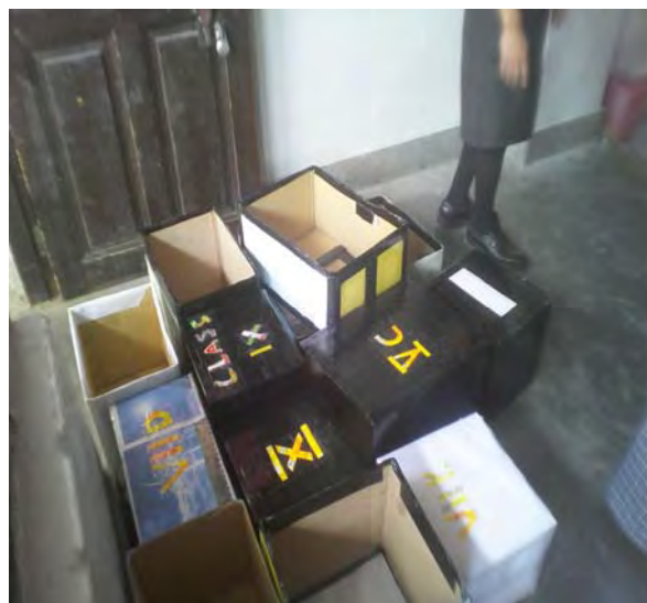
Making of dustbin for segregation of papers and plastics out of waste cartoon boxes