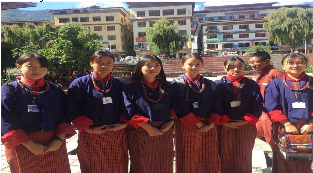
Wearing jeru during cultural programs