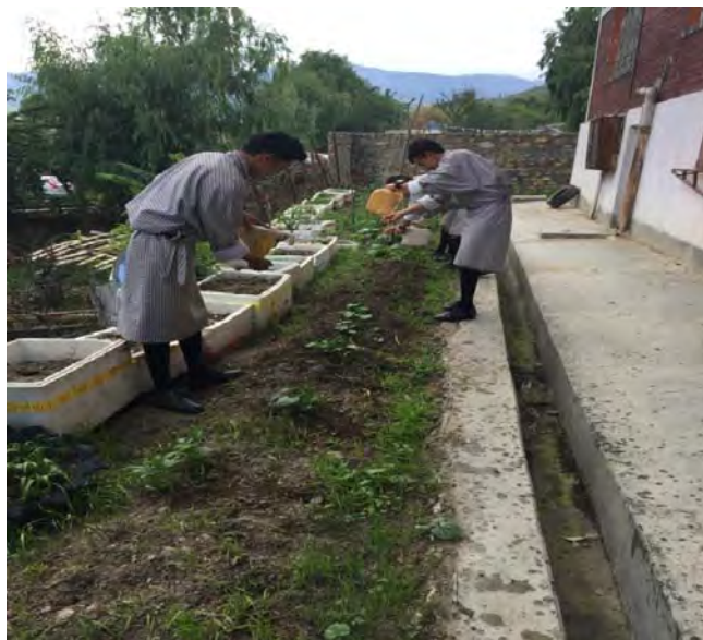
Reuse of bottles as basket and thermal col boxes as gardening pots