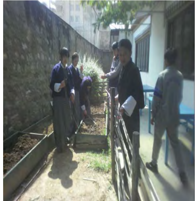
Making of organic compost pit