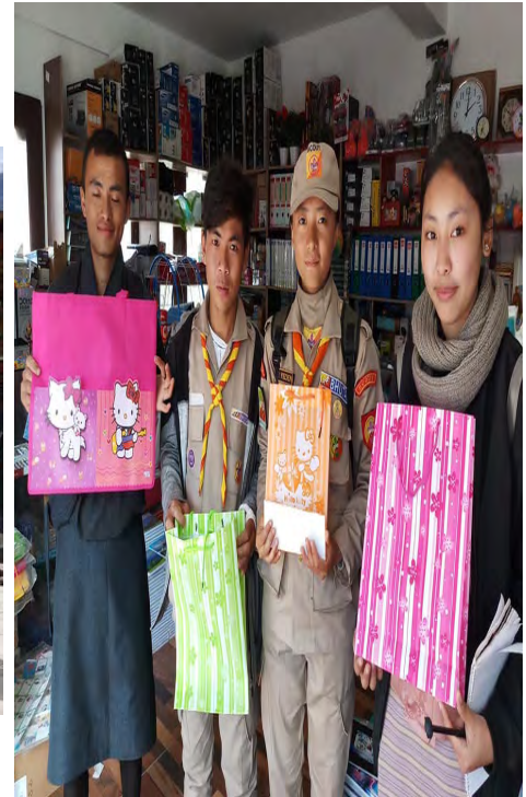
Door-to-Door Awareness: Reinforcement of Plastic Ban Notification 1999 with Bhutan Scout Youth Forum