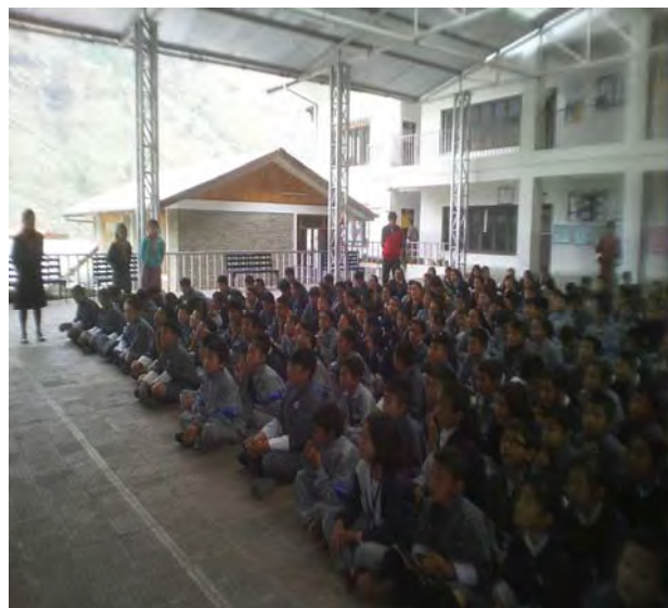
Awareness programs for youth action for 4Rs