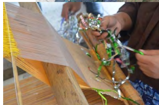
Composting and plastic weaving, basket making