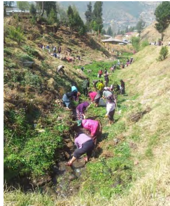
Awareness Campaigns and communities involvement