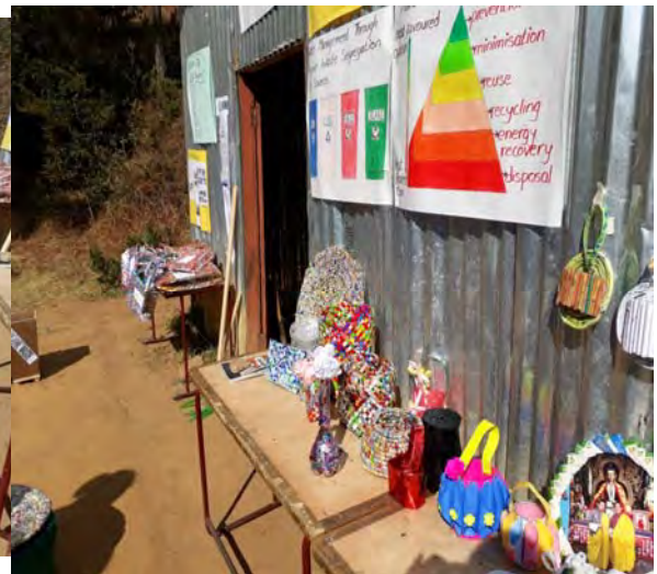
Youth Action for 4Rs corner during the Club Exhibition.