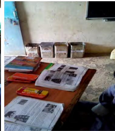
Segregation bins in the class to teach children about waste segregation.