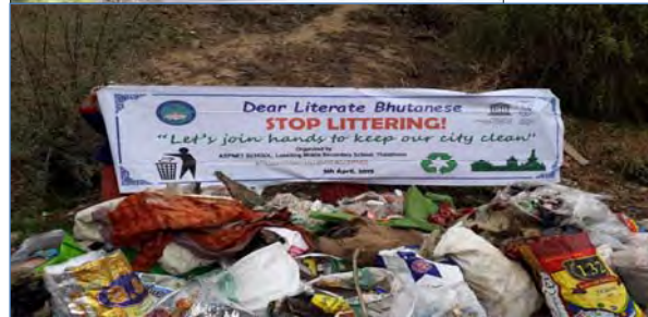
Cleaning up streams