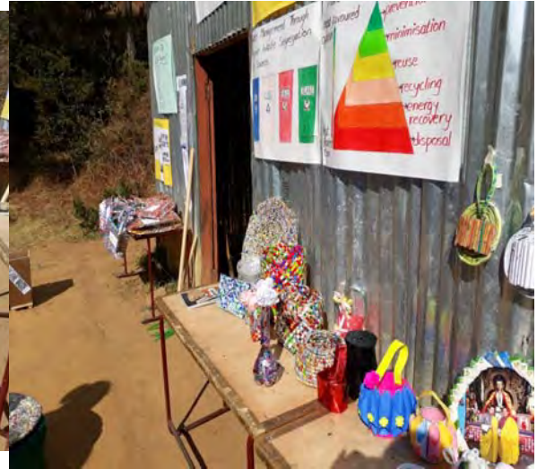
Youth Action for 4Rs corner during the Club Exhibition.