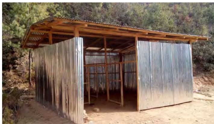
Constructed waste storage and segregation house