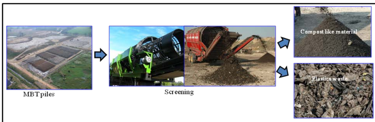
Figure 1: The MBT process in Phitsanulok Municipality

The MBT process in Phitsanulok consists of several steps including unloading of the received waste, homogenisation, piling, aeration, sieving and separation of compost-like materials and plastic waste. Homogenisation is the initial treatment step where de-bagging and mixing is done by using a rotating drum for 45 minutes. In this mechanical step, many larger pieces of materials are crushed and most of the tied plastic bags are opened. After the homogenisation, stabilisation piles are built following a design that facilitates both aeration and leachate run-off. The period needed for biological stabilisation and degradation of the organic materials in these piles is 9 months. After that, the piles are dissembled using an excavator. The stabilised material is then screened to separate compost-like materials, plastics and inert materials. The MBT process is shown schematically in Figure 1.