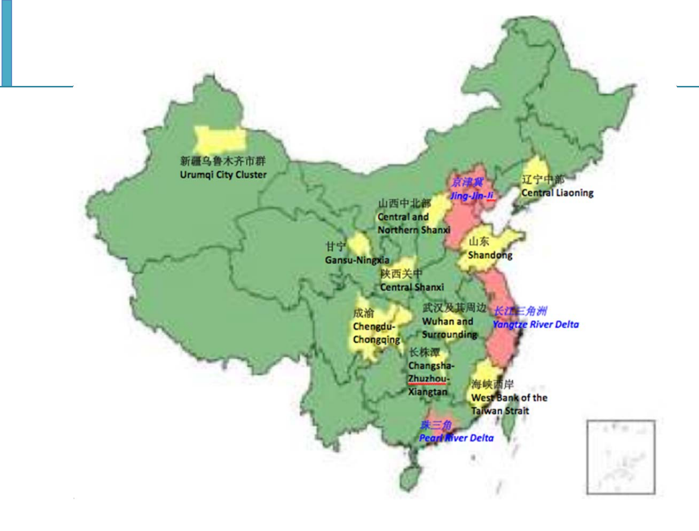
Figure 2: Key Regions for Joint Prevention and Control for Air Quality Management<sup>7</sup>

The Regional Plan designates three major regions and ten city clusters, and specifies their overall priorities (Regional Plan section 3.1.1.). All of the key regions and city clusters should focus on PM<sub>2.5</sub> and ozone, and additional priorities such as PM<sub>10</sub>, acid rain, SO<sub>2</sub>, NO<sub>2</sub> and traditional coal pollution are designated for particular regions and clusters. The three major regions are Jing-Jin-Ji (Beijing-Tianjin-Hebei Provinces), the Yangtze River Delta and the Pearl River Delta. The ten city clusters are central Liaoning Province, Shandong Province, Wuhan region, Changsha-Zhuzhou-Xiangtan, Chengdu-Chongqing, the West Bank of the Taiwan Strait, Gansu and Ningxia, Central and Northern part of Shanxi (山西) Province, Central Shanxi (陕西) Province and Urumqi City Cluster. In total, it covers 107 cities suffering from serious air pollution, accounting for 14 percent of China's land area, 48 percent of its pollution, 71 percent of total economic output and 52 percent of coal consumption (MEP, NDRC, MOF, 2012). Generally, it covers more developed regions in eastern, central and western China, with denser population, and more severe pollution. The Key Regions are illustrated on the map in Figure 3.