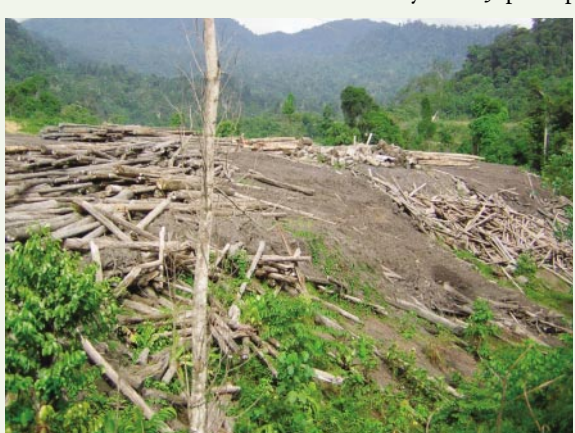
Log pond, concession forest, Sarawak

This policy brief reviews and compares the designs of procurement policies in Japan, the United Kingdom, the Netherlands and France. It identifies commonalities and differences in their approaches and concludes that there is an essential set of elements that all procurement policies must include to be robust. This set of elements is used to identify how Japan's procurement policy could be