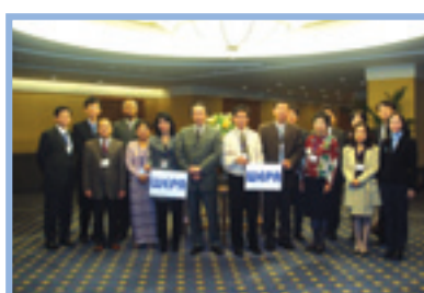
Working meeting for policy-related information database