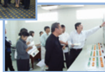
Working meeting related to the database for water environment conservation technologies