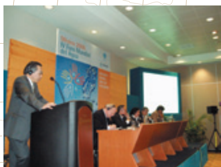
Session at the WWF4