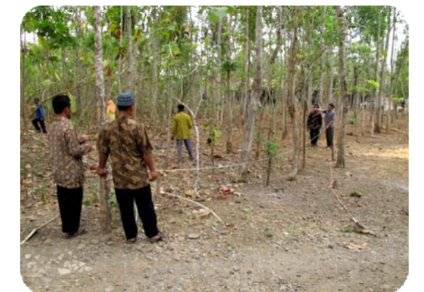
Figure 9: Terong villagers participating in field training

A 1-day district level workshop on CCA was organised in Gunung Kidul and was attended by the participating villages, the district government (heads of forestry and environment), IGES, DKN and ARuPA. Semoyo explained their CCA work and showed a video that described CCA and the importance of environmental services to the community. Terong explained that they had established a total of 180 plots under the CCA project.