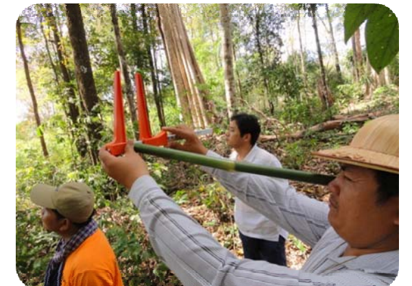
Figure 1: Communities testing alternative methods for estimating tree diameter at upper stem sections, Seima Community-Based Production Forest, Cambodia

In particular, when communities themselves are forest owners and managers, it makes good sense for them to be involved in any efforts to generate scientifically verifiable data to monitor