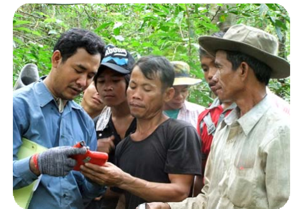
Figure 6: Trainer explains how to read clinometers to community members

Carbon assessment cannot be a stand-alone activity and should be integrated into the broader forest management strategy. The CCA action research in Cambodia aims at enabling local communities to measure and estimate carbon stocks as well as testing the timber inventory methodology set out in the Community Forestry Guidelines. In 2010, the action research activities included REDD+ awareness raising; consultations and community launch meetings; training of trainers on inventory techniques; the testing of alternative plot designs and measurement methods; training of 30 community members; inventory; data collection for diameter-height relationships; and data analysis.