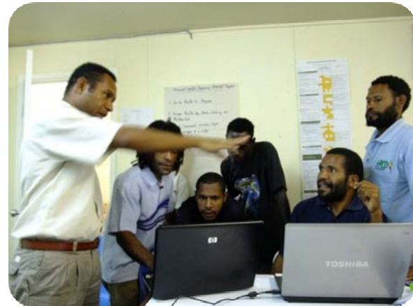
Figure 4: GIS training, FPCD Office, Madang

training was conducted using MapInfo Professional.