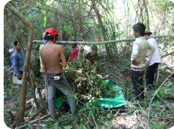
Figure 7: Weighing leaves to develop a biomass allometric equation

current guideline allows estimating most key carbon pools.