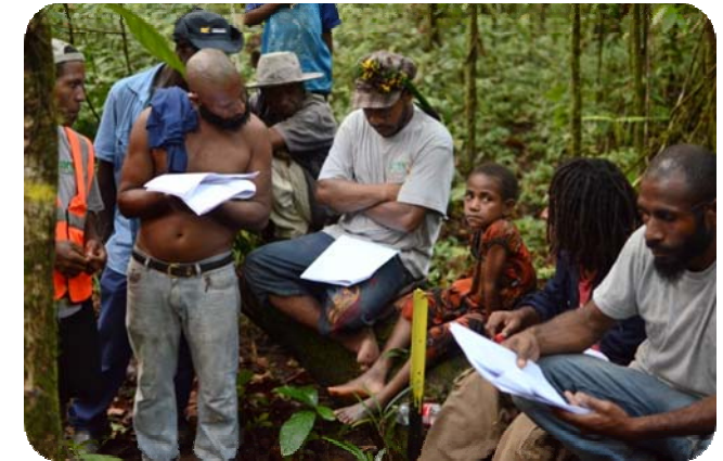
Figure 3: Preparing to establish and measure sample plots, Brahman, Madang, Papua New Guinea