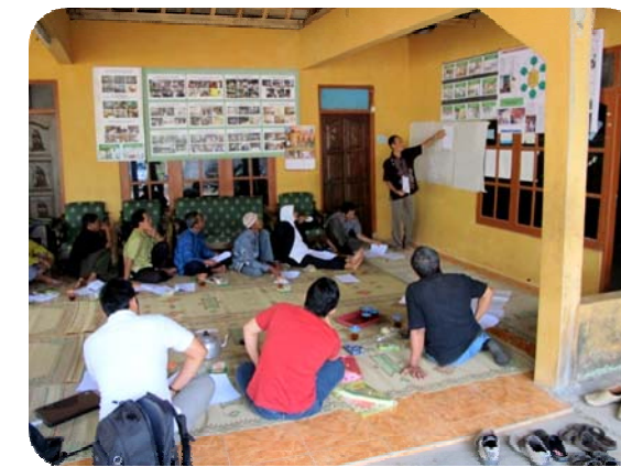
Figure 8: Semoyo villagers acting as trainers at Terong Village

The activities in Semoyo in 2011 have included: further development of training materials; a refresher training for 25 villagers and training on MS Excel for 21 villagers; improvement of the filing system; plot maintenance; measurement of litter and non-wood carbon stocks; and remeasurement of wood carbon stocks. The Semoyo leaders are currently preparing a learning module on environmental issues, with climate change as one of the main subjects. They intend to use radio to make this module available.