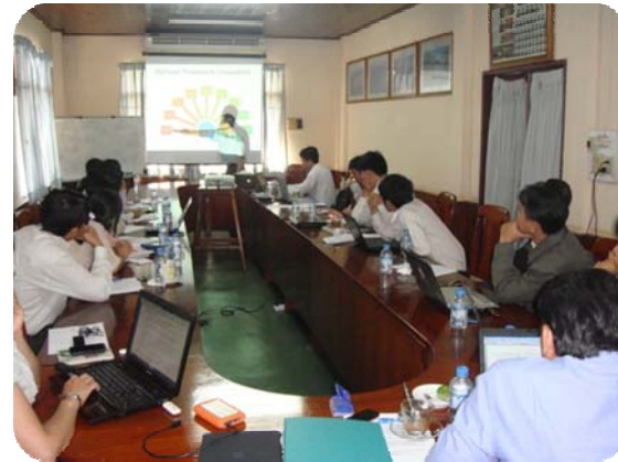
Figure 10: CCA training at NUOL

https://sites.google.com/a/nuol.edu.la/bo-utthavong/cca-in-laos/nuol-researcher-training-ws