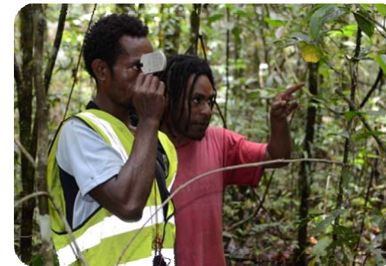
Figure 5: Training on height measurement

monitoring. Nested sample plots have been established across the 5 forests to generate the necessary data. The plots are set out using metal stakes, the trees within the plot are numbered and tagged and the measurements are recorded. For data processing, an Excel spreadsheet with inbuilt functionality is used. Preliminary analysis indicates high variation in carbon stocks within the same vegetation class, reflecting high variation in disturbance and topography.