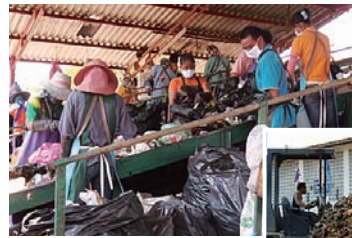
Figure 1: Some examples of 3Rs-climate friendly waste management practices

The indicator “co-benefits of the 3Rs (reduce, reuse, recycle) of municipal solid waste on climate change mitigation” aims to maximise the use of resources which can significantly contribute not only to reducing GHG emissions but also to receiving other co-benefits. These benefits include creating green jobs, improving social well-being, reducing health risks, enhancing economic development, saving landfill space and minimising environmental loads from landfill of fresh waste or incineration.