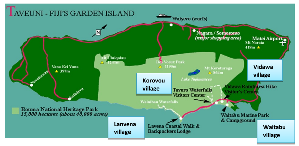
Figure 2: Map of the Bouma National Heritage Park in Taveuni Island

between different components of the landscape and seascape is relatively high. The four villages have been also involved in community-based ecotourism since 1990, with funding assistance from the New Zealand Aid Programme. Thus, the communities have been actively involved in natural resource management, particularly related to ecotourism.