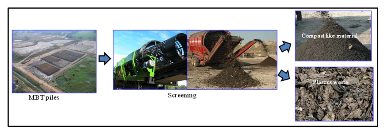
Figure 1: The MBT process in Phitsanulok Municipality

The MBT process in Phitsanulok consists of several steps including unloading of the received waste, homogenisation, piling, aeration, sieving and separation of compost-like materials and plastic waste. Homogenisation is the initial treatment step where de-bagging and mixing is done by using a rotating drum for 45 minutes. In this mechanical step, many larger pieces of materials are crushed and most of the tied plastic bags are opened. After the homogenisation, stabilisation piles are built following a design that facilitates both aeration and leachate run-off. The period needed for biological stabilisation and degradation of the organic materials in these piles is 9 months. After that, the piles are dissembled using an excavator. The stabilised material is then screened to separate compost-like materials, plastics and inert materials. The MBT process is shown schematically in Figure 1.