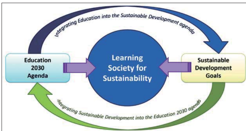
Figure 5.2 Two parallel approaches for empowering a learning society for sustainability

repeatedly stressed. Not quite as frequently but with as much zeal, the importance of education as a cross-cutting MOI and the ability to enrich achievement across the SDGs through the stronger integration of education throughout the sustainable development agenda (and not only as a standalone goal) has also been highlighted. Although ESD is present within Target 4.7, throughout the post-2015 development agenda and the Education 2030 agenda an integrated and holistic understanding of education and sustainable development (or learning for sustainability) is relatively unapparent. This chapter concludes by recommending two parallel approaches for achieving a learning society for sustainability through a focus on integrating education into sustainable development and integrating sustainable development into education (see Figure 5.2 and Table 5.2 for additional information).