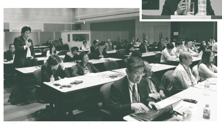
UNEP International Resource Panel Open Seminar

In FY2012, the EE group also actively participated in international policy formulation processes and discussions on green economies. The group input its research results to the United Nations Conference