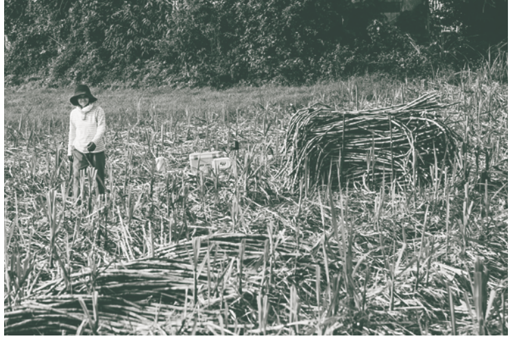
What makes sugarcane insurance a viable proposition?

As improving capacity to adapt to the impacts of climate change remains a major issue, the NRM group conducted research on the progress of mainstreaming adaptation policies and assessment of adaptation practices for agriculture sector in the Gangetic Basin, and published a research report on adaptation effectiveness indicators. Case studies were carried out on agricultural policies in Japan to characterise and measure mainstreaming adaptation into development. The group developed training needs assessment and training module for adaptation policies in the agricultural sector in Bangladesh, Cambodia, Lao PDR, Myanmar and Nepal, and started pilot training programmes in Bangladesh and Cambodia with funding from the Asia-Pacific Network for Global Change Research (APN). Surveys were carried out in Japan, Malaysia, the Philippines and Viet Nam to understand various issues that hinder the scaling up of crop insurance. The group published a preliminary report based on this research and will embark upon a APN funded three-year research project on insurance for climate change adaptation and disaster risk reduction in the Sixth research phase of the institute. In addition, an MOU was concluded with the Institute of Microfinance in Bangladesh for joint research on the role of microfinance to improve resilience and adaptation capacity to climate change.