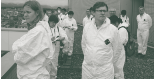
On-site visit in Fukushima