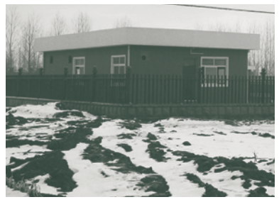
Waste water treatment facility in Weihai city

The Beijing Office was set up within the Sino-Japan Friendship Center for Environmental Protection of the Ministry of Environmental Protection of China (MEP) in July 2006 as a base to easily carry out research activities in China. It has a pivotal role in developing various studies and research activities in cooperation both bilaterally with China and multilaterally (including with international organisations).