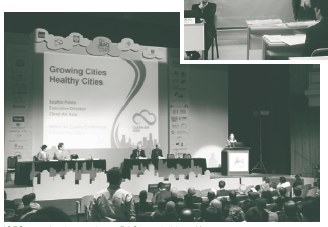
IGES organised a session at BAQ2012 in Hong Kong

of an Asian Science Panel on Air Quality was proposed at BAQ2012 as a new international cooperation framework for air quality management in Fast Asia.