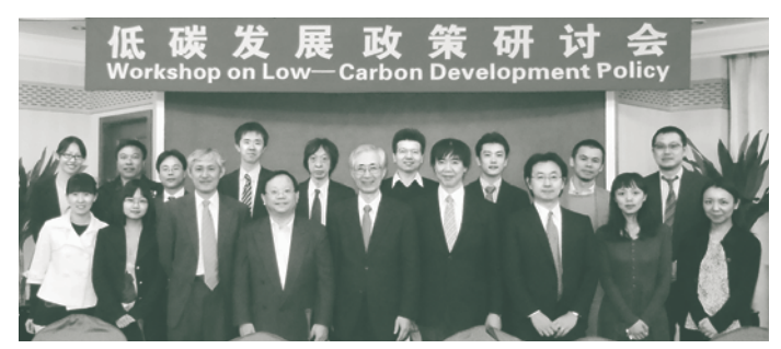
Policy research workshop with Chinese policymakers

IGES actively conducted research for climate change issues in the midst of negotiations which aim to develop post-2020 climate stabilisation frameworks with the participation of all countries under the UN Framework Convention on Climate Change. IGES organised a workshop to exchange ideas with Chinese policymakers in October 2012, at which discussions were held on low-carbon actions by