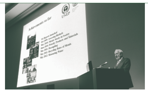
Public seminar "Green Economy and Resource Efficiency"

Resource Panel and the latest trends of resource efficiency policies" in Tokyo, Japan, at which the group called attention to the importance of improving resource productivity as relevant to the future development of Asia, including Japan. As well, the SCP group continued policy re-