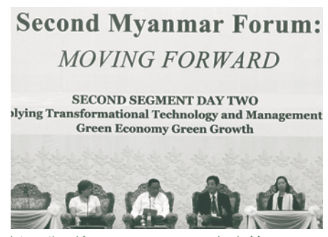
International forum on green economies in Myanma

The CC group organised the IGES-ERI Policy Research Workshop in October 2012 in Beijing, China with the Energy Research Institute (ERI) and exchanged ideas on the possible form of Japan-China cooperation for low-carbon development and approaches to mainstream low-carbon strategies into sectoral policies. The CC group took part in the Second Green Economy Green Growth