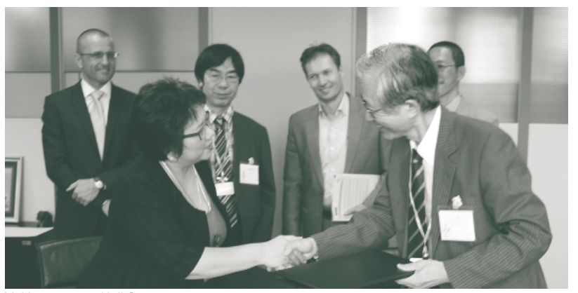
MoU ceremony with ILO