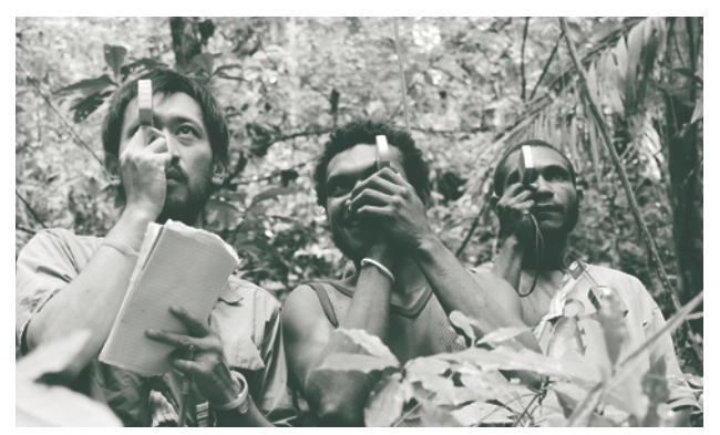
Community-based forest monitoring

forest carbon stocks in developing countries. IGES research activities on REDD+ highlighted the need for good governance and stakeholder participation. The NRM group developed methods to engage local partner organisations and local communities in tracking forest carbon stocks in five countries in Asia (Lao PDR, Indonesia, Papua New Guinea, Cambodia and Viet Nam), and published a policy brief, "Community-based Forest Monitoring for REDD+: Lessons and reflections from the field," with the knowledge obtained through this study. This policy brief was cited in Global Observation of Forest and Land Cover Dynamics. The NRM group published timely briefing notes which analysed discussion trends on REDD+ in major international negotiations, and also expanded the REDD+ Online Database, which compiles information on national REDD+ preparatory activities and REDD+ projects.