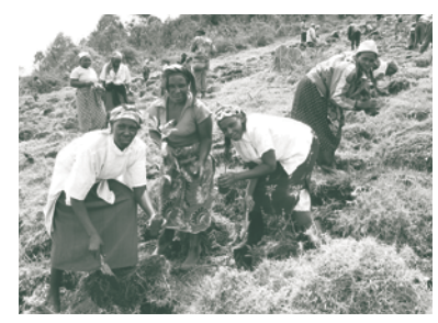
Tree planting in Kenya

the "Rehabilitation of Degraded Lands in Asia and Africa", commissioned by the Japan International Cooperation Agency (JICA) as part of capacity building activities for environmental protection. JISE also organised a public environmental forum "Tsunamis and forest seawalls in relation to Japan's coastlines" and conducted exchange/ public awareness campaigns, such as tree-planting ceremonies overseas