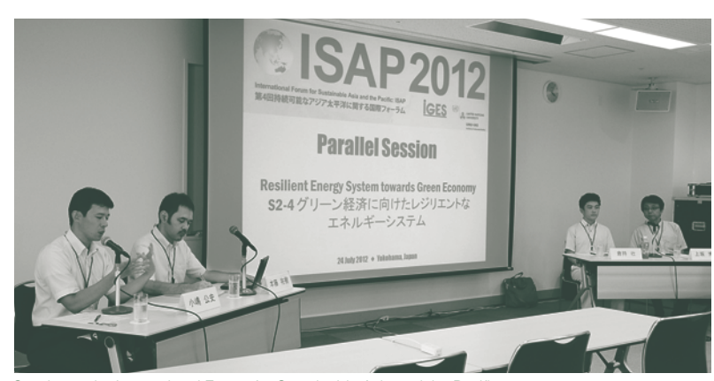
Session at the International Forum for Sustainable Asia and the Pacific

The EE group implemented quantitative analysis using the multi-regional inputoutput (MRIO) model to account for greenhouse gas emissions embodied in