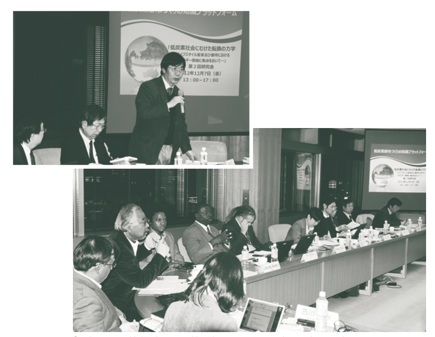
Study group with business and local governments on low-carbon society