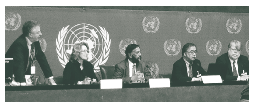
Press conference with the IPCC TFI