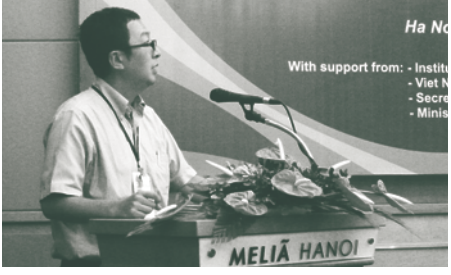
Presentation at expert workshop

carried out research on international certification and quality control of recycling industries and organised an expert workshop in Hanoi, Viet Nam in July 2012. The group also took part in discussions on the development of guidelines on environmentally sound management (ESM) under the Basel Convention process.