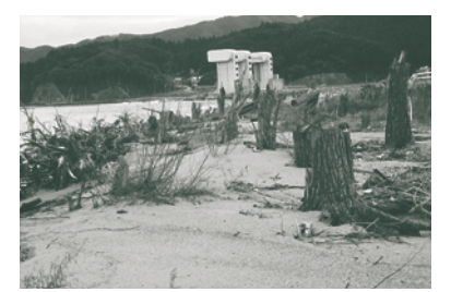
Study site in disaster area (Iwate Prefecture)

disaster prevention forests using independent financial resources and research grants. Particular focus was put on studies on damaged vegetation in disaster areas as well as investigations into potential natural vegetation and the transition process for the regeneration of the "Great Forest Seawall," which aims at disaster prevention and spontaneous regeneration in response to the Great