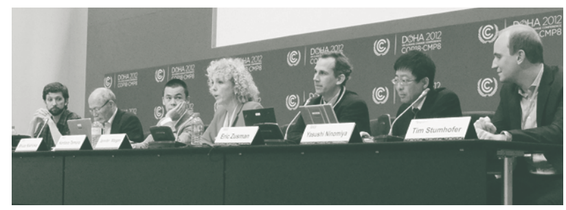
IGES side event at COP18

Myanmar Forum in November at which discussions were held on sustainable development in Myanmar, and proposed recommendations for leapfrogging development based on low-carbon growth strategies. The group also organised a side event, The Road to a Low-Carbon Future in Asia, at COP18 in Doha, Qatar, in November 2012, with the Greenhouse Gas Management Institute (GHGMI) and ClimateWorks Foundation. (This event was broadcast on NHK news.)