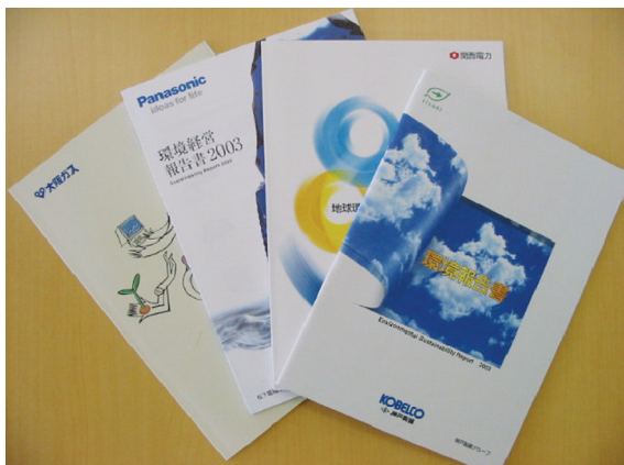
various environmental reports

a) Research on Asia and the Pacific: Watching the formation of the east Asian economic sphere, we implemented comparative research on corporate environmental management in Japan, China and South Korea. In concrete terms, we conducted a survey of corporations in China and South Korea based on a survey carried out each year by the Japanese Environment Ministry. We then compared the results from the three countries. The results showed that Chinese corporations are making good progress on policies concerning the setting up of environmental goals but the introduction of management tools such as LCA and environmental reports has been slow. On the other hand, Korean corporate environmental management was shown to have made great progress over the one-year period.