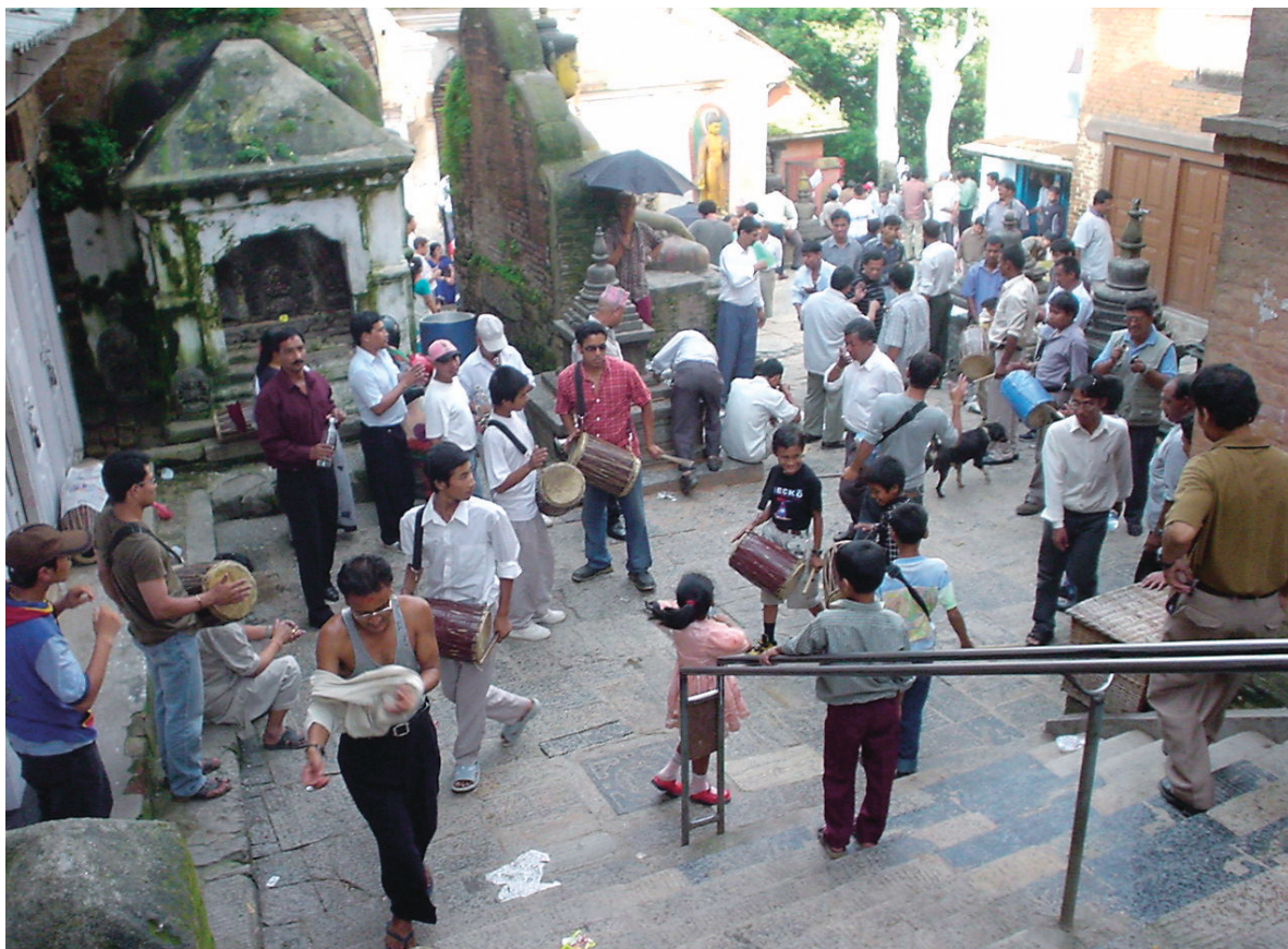
People in Nepal

cation. In those 6 years, new international trends have emerged. The UN declared the ten-year period from 2005 as the UN Decade on Education for Sustainable Development, led by UNESCO with Japan as one of the main proposal-makers. Such new trends in global education are expected to draw a great deal of attention world-wide. As one of the issues taken up in the Third Phase, IGES will investigate the level of engagement in the UN scheme, by developing practical plans and conducting research as a participant in this scheme.