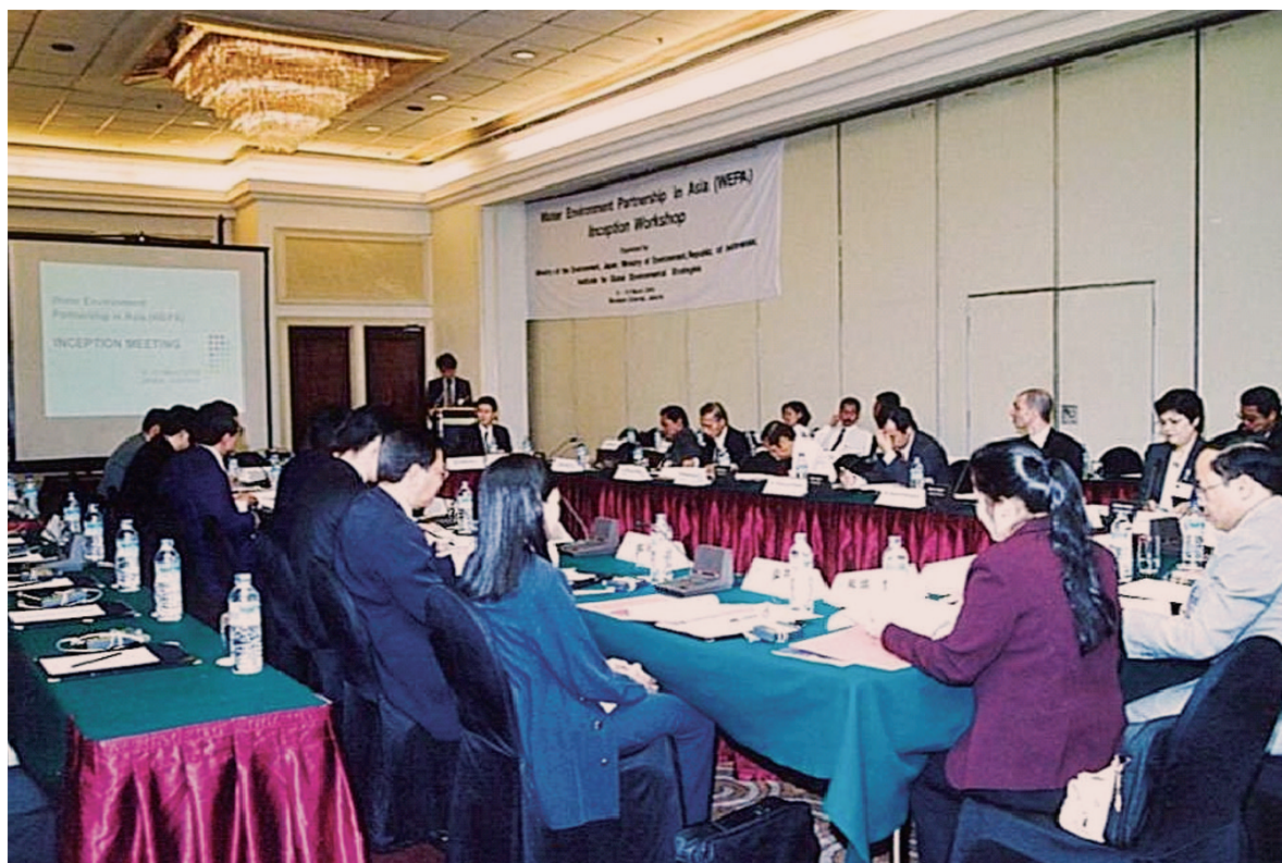
WEPA Inception Workshop

WEPA is the initiative proposed by Ministry of the